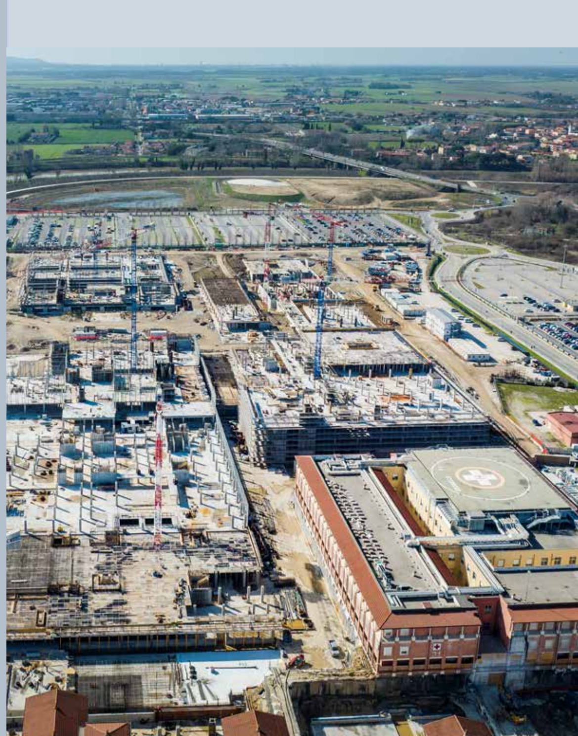
UNIVERSITY HOSPITAL COMPLEX "NEW SANTA CHIARA" CISANELLO – PISA

Specific focus is placed on process management to ensure service quality, from loading methods through to site transport and the optimisation of delivery times. Ferroberica continually monitors customer satisfaction. The results of assessments are applied for improvement in the production area and at all phases that contribute to achieving excellent customer service.